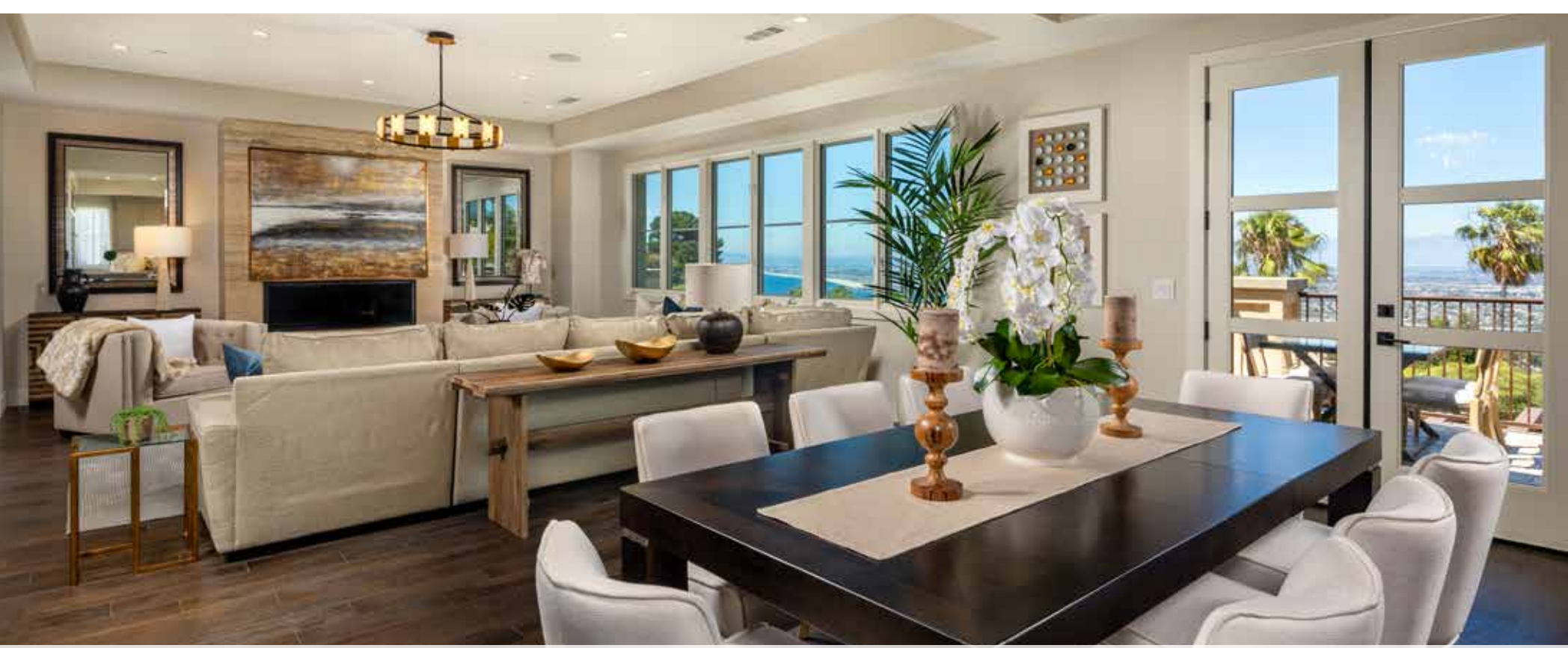
Double Primary Suites | City & Ocean Views | Resort Style Backyard